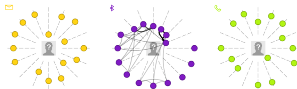
Figure 2. Small-multiple webcharts each for a different channel in the network – sms, Bluetooth contacts and phone calls.

The biggest challenge that we faced throughout the various iterations of the visualizations was how to display all three data channels for the user's social contacts. The data cannot be directly compared as each of the communication forms are different, however we would still like to show them simultaneously as well as allow people to make indirect comparisons between the contacts based on all three channels. In order to facilitate this we have decided to use the "small-multiple" concept as introduced by Tufte [13]. Instead of drawing one web, we would draw a web chart for each of channels used, as shown in Figure 2.