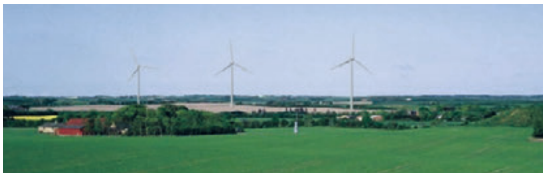
Visualisation of 1.75 MW (93 m) turbines (left) and 3.6 MW (150 m) turbines (right) from a Danish project in Gisselbæk Danish Energy Authority (2010).

Renewable development actually takes place in a society made up of people – people who may be suspicious of new technologies, feel sceptical of the motives of developers, or see the changes to cherished landscapes as too high a price to pay for the benefits of wind energy. Indeed it appears that the consequences of this have not been fully grasped.