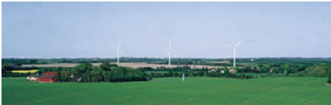
Figure 36 – Visualisation of 1.75 MW (93 m) and 3.6 MW (150 m) turbines.

Mechanical noise is created by the machinery inside the nacelle of the turbine. Although this includes components such as yaw drives, cooling fans and hydraulics, the dominant sources of noise are the gearbox and the generator (Pedersen et al. , 2003). These noises are usually of constant frequency, since they are generated by rotating equipment, and they are transmitted along the structure of the turbine (the tower and nacelle) before being emitted from its surface (Rogers et al. , 2002). Occasionally this may create pure tones, in contrast to most noise emitted from wind turbines, which is a mixture containing a large range of frequencies (“white noise”). For noise containing pure tones the Danish regulations impose a penalty of 5 dB(A).