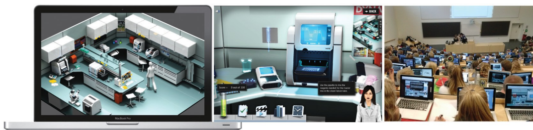
Figure 1 Screenshots from the gamified laboratory simulation tested in this study (Labster, www.labster.com ) (left, center). Students used the simulations from regular computers at home (in the case of testing at Stanford University Online High School) or in class (right).

We also conducted a study on 57 students from four Danish high schools. Forty-four percent of the students agreed or completely agreed with the statement, “I consider pursuing an education within biotechnology or other biological subject to a greater extent, after having used the gamified laboratory simulator.” This indicates that gamified laboratory simulations may provide a powerful case for initiatives to increase students' engagement and motivation for further studies and careers within biotech. Large-scale longitudinal studies measuring the actual study and career choices of students exposed to gamified laboratory simulations compared with a control group would be valuable to guide future decisions.