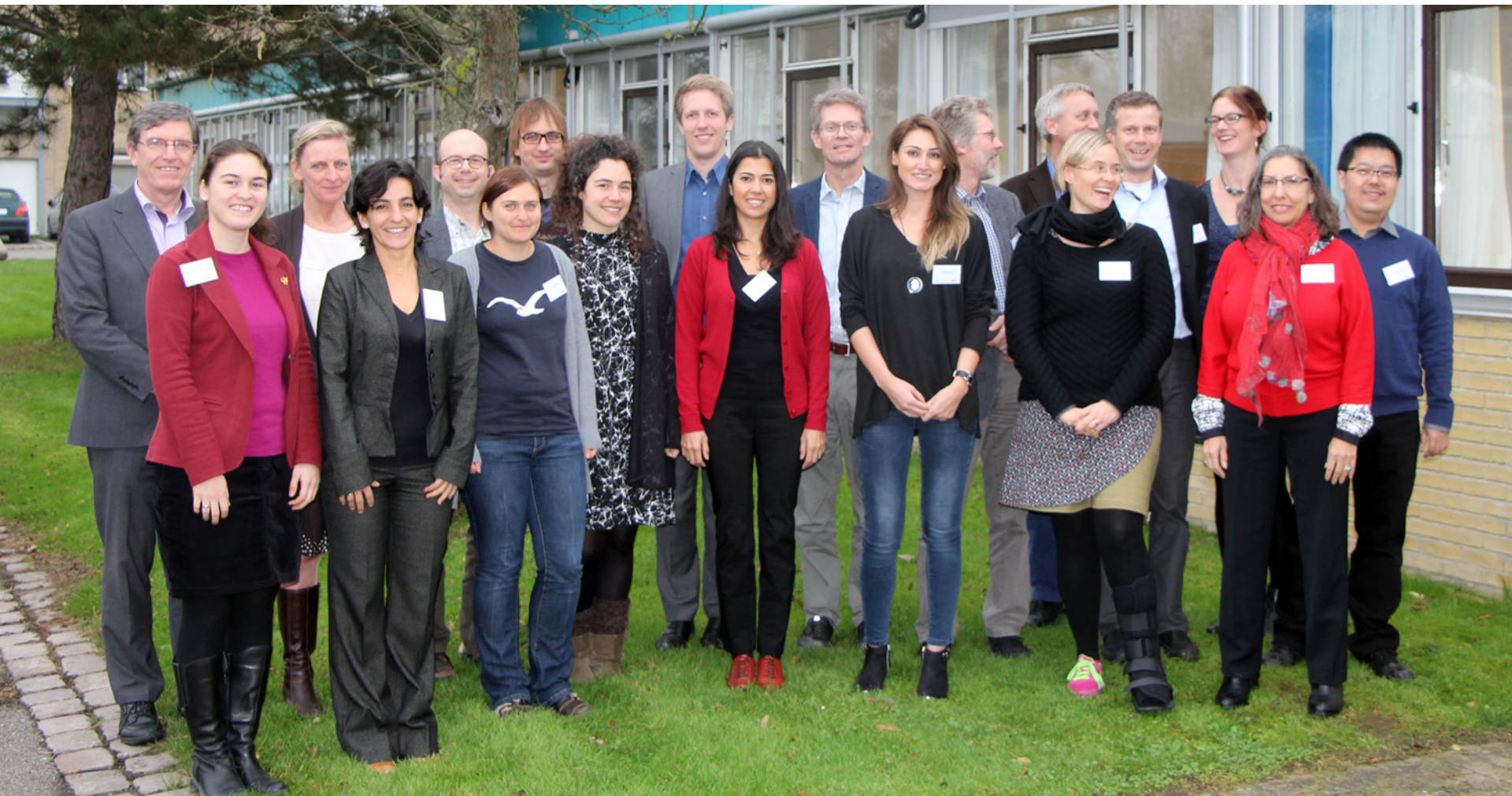
22 participants from 14 different EERA Wind member institutions