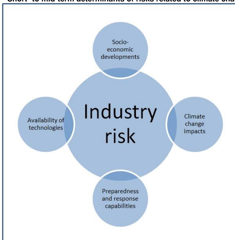
Figure 1: Short- to mid-term determinants of risks related to climate change

Finally, we have characterised the impacts of global warming through high-resolution projections of likely changes in temperature, precipitation and wind speed. Data shortcomings prevented us from using measurement data to validate model outputs (we had to use re-analysis data, which is nonetheless considered to be effective in removing key biases).