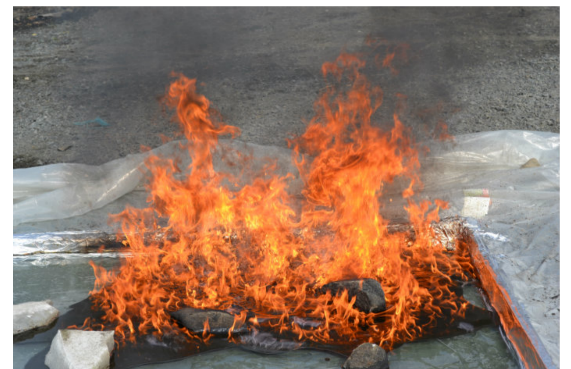
Photo 5. Oil burning in first burn

1st burn flame area : 0.96 m 2 2nd burn flame area : 0.47m 2