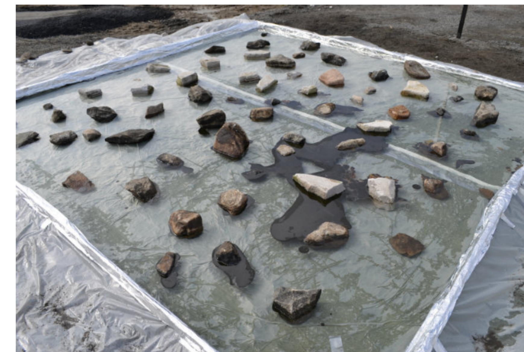
Photo 3. The oil after the herding

The herder agent proved effective in significantly contracting the oil slicks. The slick area has been reduced 39%.