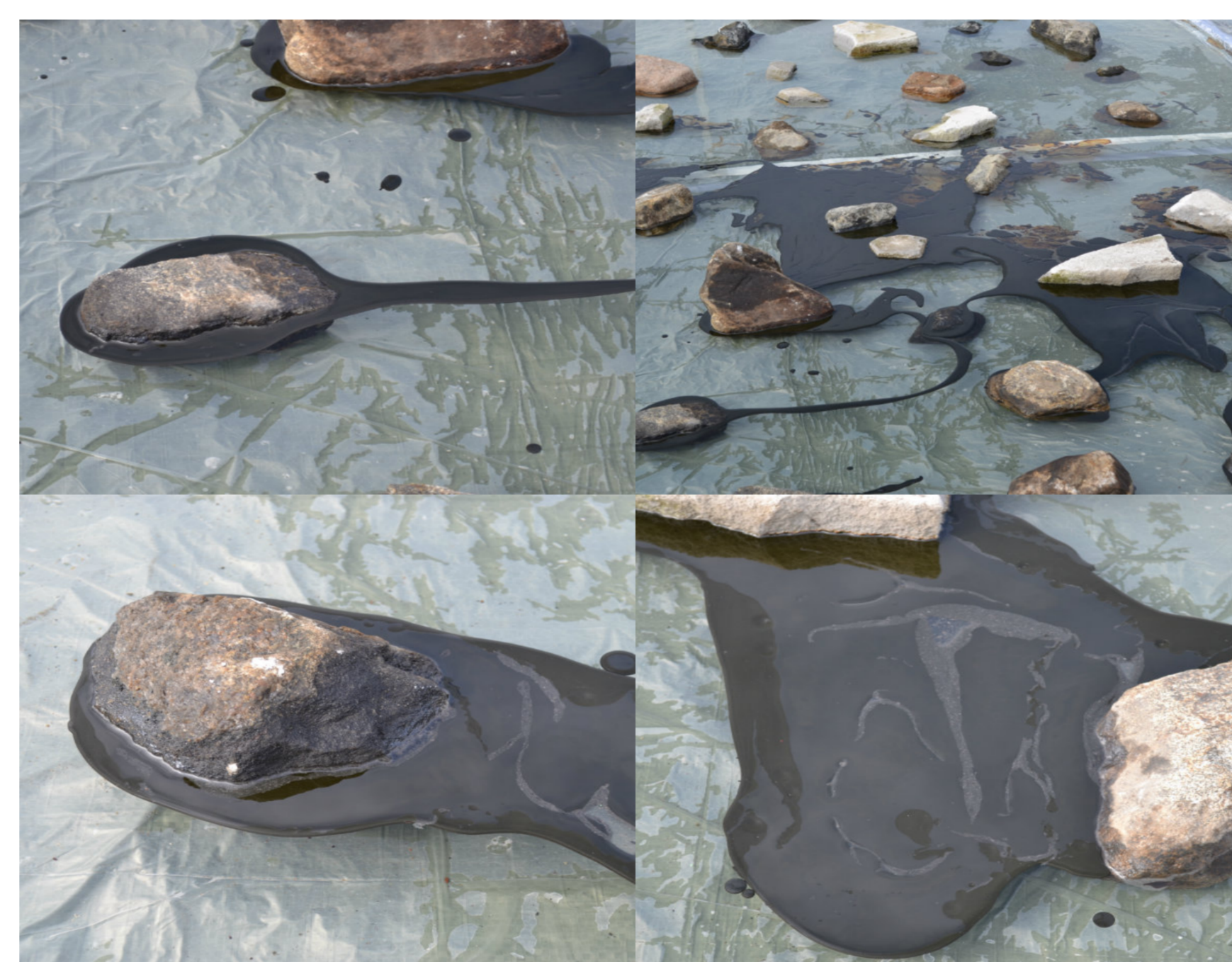
Photo 4. Individual oil slicks

After the herding, besides the main oil slick, there were also individual oil slicks created around the obstacles.