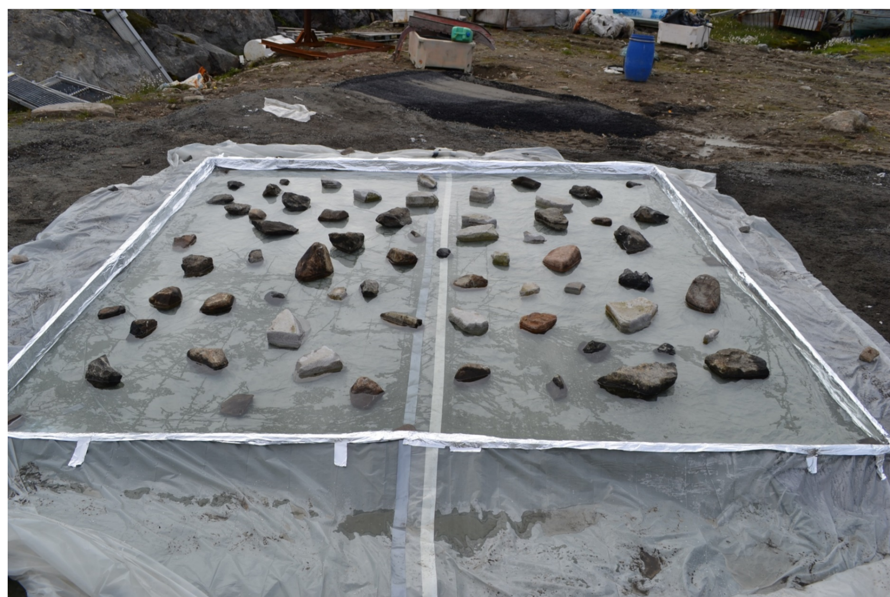
Photo 1. Experimental set up

A 4.0 x 4.0 x 0.1 m 3 basin was created in the soil and wooden planks were used to reinforce the cavity walls. A plastic sheet covered the bottom while reflecting metallic tape and aluminum foil used to cover the top layer of the plastic sheet for protection. Stones from the local area laced inside the basin to cover around 20% of the surface area. Fresh water (480 L) was used to fill the basin.