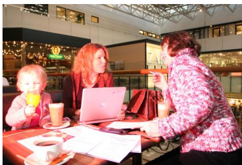
Figure 1: Web learning can be done in many environments.

Based on the experiences from this course we redesigned the introductory mathematics course at the Technical University of Denmark using the ideas of learning objects, and by combining them with lectures and group work.