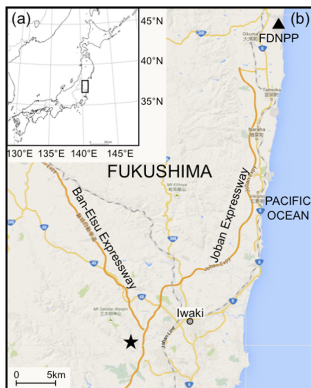
Fig. 1 a Japanese map. The rectangle stands for the studying area. b Enlarged map of the rectangle in (a) showing sampling site marked with a star

Iodine in the leaf samples was extracted by combustion followed by trapping with a 0.4 M NaOH–0.05 M \text{NaHSO}_3 solution [15]. An aliquot of the trapping solution was taken for ^{127}\text{I} determination by inductively coupled plasma mass spectrometry (ICP-MS) at the Technical University of Denmark. The iodine in the remaining trapping solution was further separated using solvent extraction after the addition of 2 mg of ^{127}\text{I} carrier and the separated iodine, in