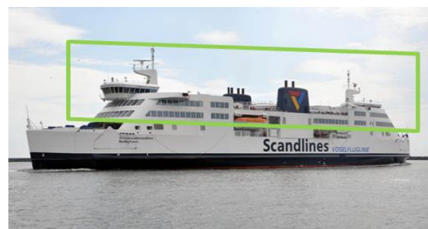
Fig. 1: PRINSESSE BENEDIKTE and the part of the superstructure considered for conversion

The vessel chosen for the study is PRINSESSE BENEDIKTE, operated by Scandlines between Rødby and Puttgarden. The upper part of the ship's superstructure has been redesigned using composites materials according to the DNV Rules for Classification of Ships (2014) and DNV's Rules for Classification of High Speed, Light Craft and Naval Surface Craft (2014). In detail, the passenger decks, the wheelhouse deck along with the masts, funnels and the wheelhouses have been considered for conversion (Fig. 1).