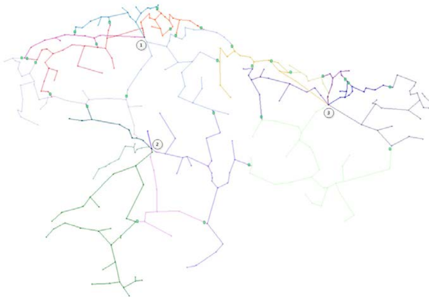
Fig. 2. Under-investigated 10 kV grid supplied by three primary substations with 28 normally-open switches