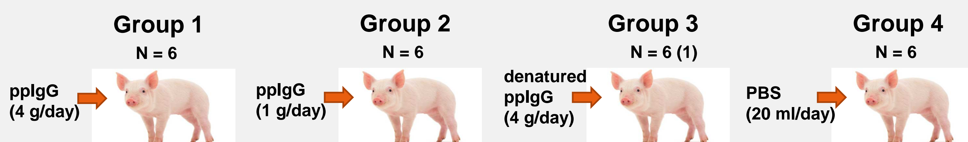
Figure 1: Weaner piglets were grouped according to treatment (see below) and observed for 15 days before they were euthanized. Different intestinal sections were emptied of faecal contents, and then and inspected for pathological changes.

A: Group 1 received daily 4 grams of multimerised pplgG, Group 2 received 4 grams of pplgG daily, Group 3 received daily 4 grams of denatured pplgG, and Group 4 received daily 25 ml of PBS. Shortly into the study, two piglets (one in each group 1 and 4) became so ill they had to be euthanized. All piglets were euthanized at day 15.