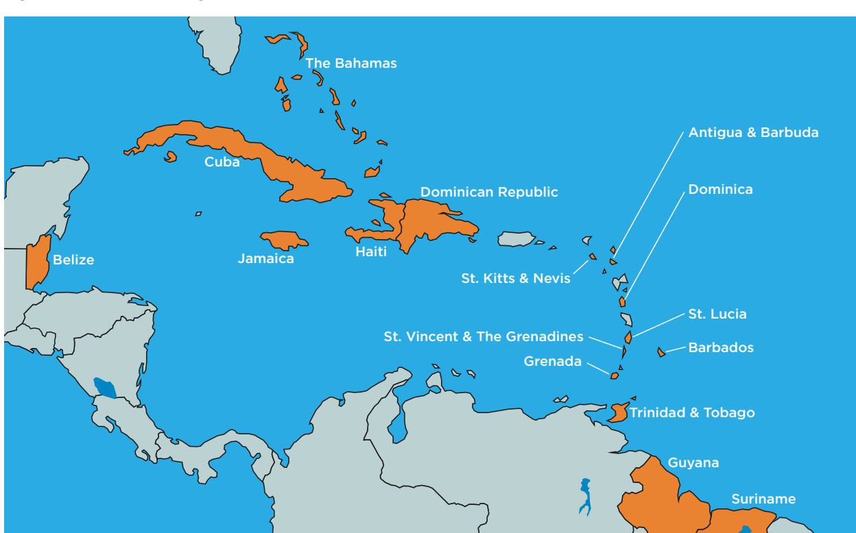
Figure 1. The Caribbean region

The Caribbean Small Island States are characterized by their high reliance on fossil fuels for electricity generation. 93.2% of installed capacity in the Carib-