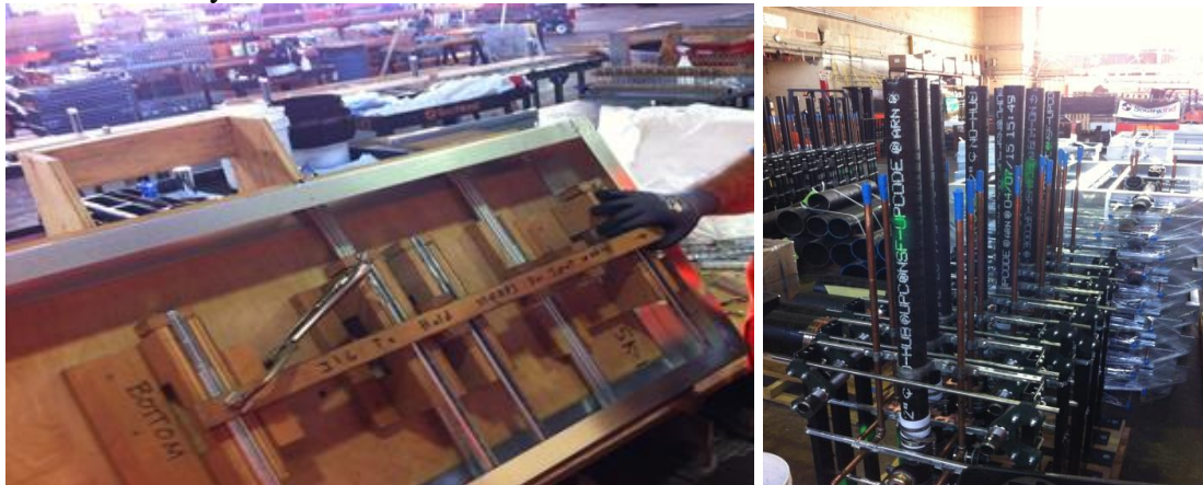
Figure 2 Welding jig on the left and stock of prefabricated modules on the right

At Jig #1, the strut is spot-welded to the metal frame for the fixture. The following work activities that occur on the current state map: 10) Clamp in Place; 13) Spot Weld Side ; 14) Spot Weld Side 2; and 17) Hammer Test. The purpose of the activity is to spot-weld square strut across the metal frame as shown in Figure 2 on the left hand side, which serves as strength for the frame and provides the attachment points for the cast iron and copper assemblies. Before the activity can take place, the frame material must be assembled and delivered by Southland's sheet metal shop in Union City. Jig #2 is the location where the completed frame is set in place and the cast iron and copper pipe assemblies are installed in the correct location. Jig #2 also uses a wheel to rotate and flip the frame around, so that the worker is always able to perform the work most efficiently.