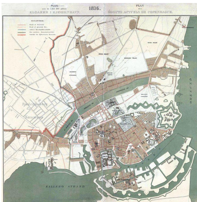
Figure 1: Map showing the sewer system in Copenhagen in 1876.

Real Time Control (RTC) of the Copenhagen sewer system was first implemented in the 1990's. The Wastewater Utility operating the sewer system in Copenhagen decided to implement RTC in the western part of the system.