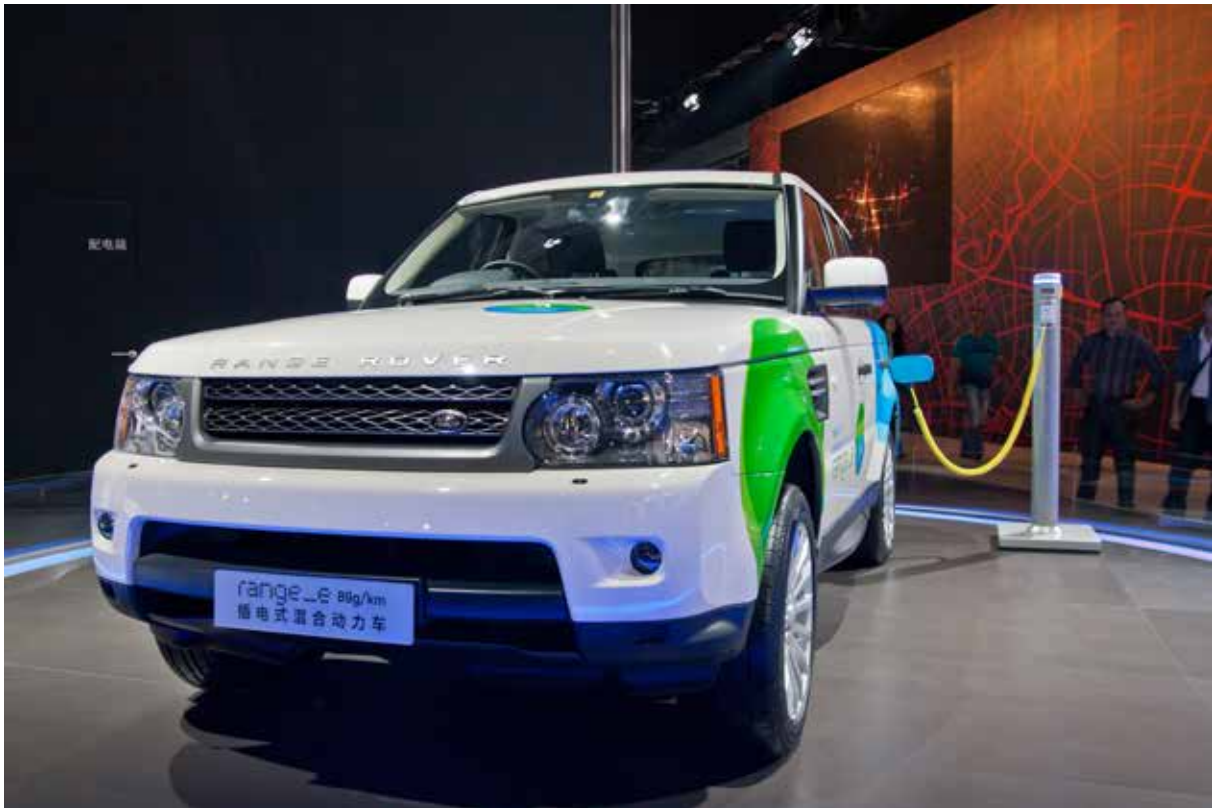
An electric vehicle on display at the 9th China International Automobile Exhibition, on November 25, 2011 in Guangzhou, China.