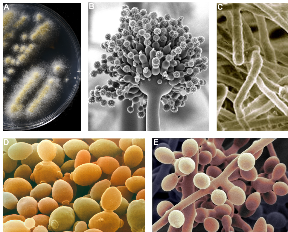
FIGURE 3 “Fungal Hall of Fame” illustrating the five most important players in industrial lignocellulose biorefinery processing and in research. (A) Aspergillus oryzae , along with (B) Aspergillus niger and Aspergillus nidulans , are the most widely used monocomponent enzyme production organisms. (C) Trichoderma reesei is included due to its exceptional secretion capacity; it is the preferred production host for enzyme blends specifically designed for efficient biomass conversion. (D) Saccharomyces cerevisiae is the organism of choice for production of ethanol from the biomass conversion-derived sugar platform. Pichia pastoris is the expression host most often used for producing laboratory-scale volumes of newly discovered enzymes to facilitate characterization and evaluation of the new enzymes for industrial potentials. (E) Myceliophthora thermophila , along with another thermophilic fungus, Thermoascus aurantiacus , represents alternatives to production of enzymes by species of Aspergillus . Credits: (A) Courtesy of Reinhard Wilting, Novozymes A/S; (B) from Read ND, in Electron Microscopy of Plant Pathogens (Mendgen K, Lesemann D-E, ed), Springer-Verlag, Berlin, Germany, 1991, with permission; (C) U.S. Department of Energy Office of Science ( http://www.jgi.doe.gov/sequencing/why/Treesei.html ); (D) Sciencephoto.com; (E) courtesy of Ronald de Vries, CBS-KNAW, Fungal Biodiversity Centre, The Netherlands.

was present in the most active fractions and was highly expressed and secreted in all fungi that degraded lignocellulose (43).