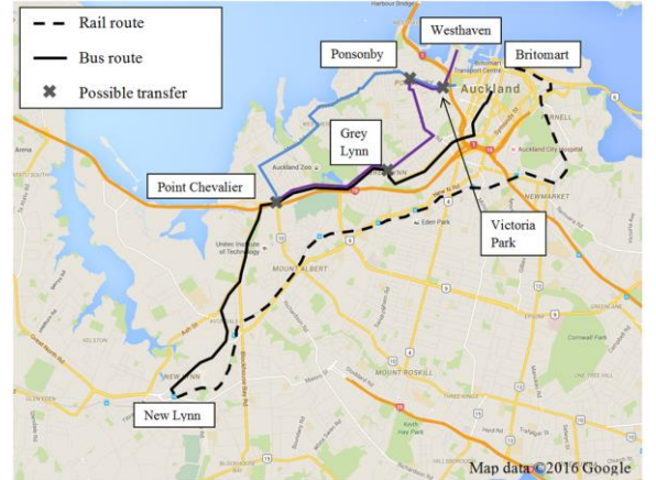
Figure 2. Auckland case study routes.

The case study considers the trips between the suburban center of New Lynn and Westhaven in Auckland's city center. The most direct route to the site is via Britomart, Auckland's central transport terminal. It is serviced by the western rail line, as well as a number of buses including express services. A number of connector bus services intersect the direct bus route at Point Chevalier providing opportunity for transfers. A map of the study area is shown in Fig. 2.