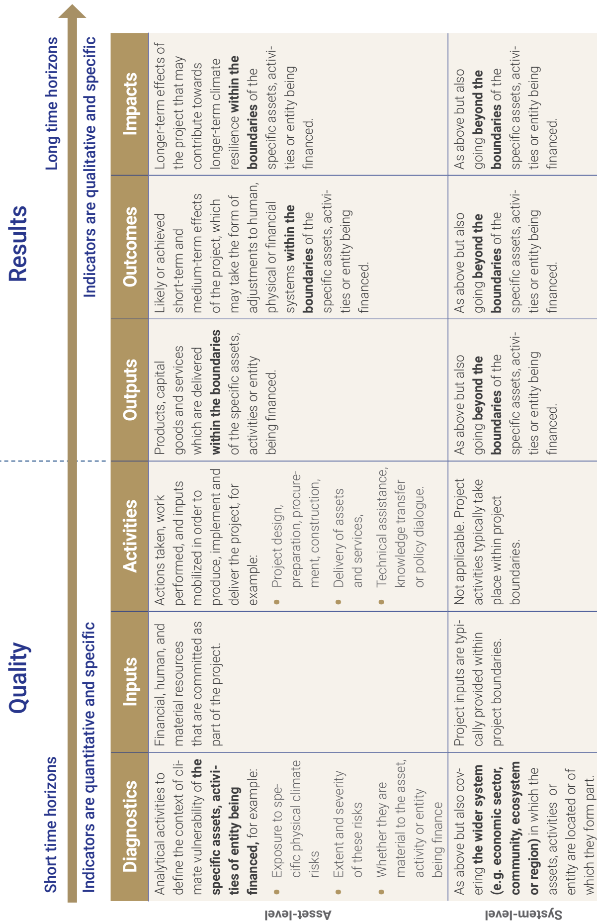
FIGURE 2 Logic model and results chain