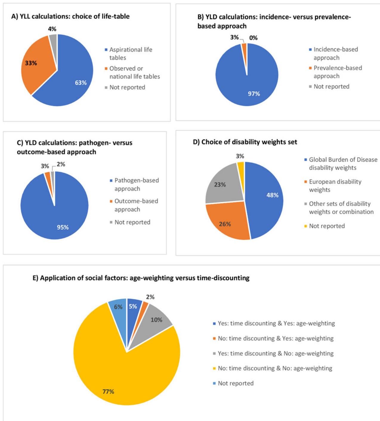
Fig. 3. Methodological approaches used to estimate YLL and YLD in independent burden of infectious disease studies, 2000–2022*. *Proportions for burden of infectious disease studies that included years of life lost calculations were reported for 102 out of 105 studies, while for those included years lived with disability were reported for 95 out of 105 studies.

estimation or over-estimation of the burden of a certain infectious disease. Each methodological choice has an impact on the resulting DALY estimation and by choosing a uniform methodology (e.g. disability weights, life expectancy) or epidemiological model (e.g. disease model, severity level distribution), these choices may not reflect the disease agent or study population, and as a result the DALY estimates will not reflect the true burden of disease.