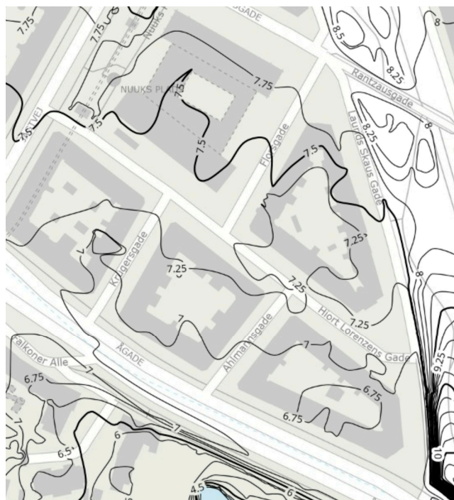
Figure 2. Topographic plan of the case study area in Frederiksberg, Denmark.

Particularly, the area in which the application of NbS was assessed is a densified area with a high degree of impermeable land cover and a mostly flat topography. By the way, in the aforementioned rain event of 2 July 2011, this area was completely flooded, which is why it was chosen as the case study to be studied in this paper. In fact, the main street in the case study area is called Ågade and it is in the lower portion of the watershed, being a critical point for two reasons: on the one hand, it has a high flow of vehicles and people. On the other hand, in terms of flooding, this street corresponds to the region that receives the runoff of the upstream areas of the watershed. In terms of land cover, the catchment area is about 6.7 ha, with 85% of impermeable surfaces and 15% of surfaces with vegetation cover. Figure 2 shows a topographic plan for the case study area.