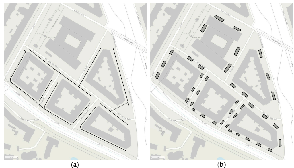
Figure 3. Distribution of NbS for Scenarios 3 and 4: (a) infiltration trench and linear garden location for Scenario 3; (b) rain garden location for Scenario 4.

Scenario 3, in turn, consisted of infiltration trenches below linear gardens located along the sidewalks and designed following the recommendations from [27]. In this scenario, the infiltration trenches were standardized with depths of 1.5 m and 50 cm wide, allowing the temporary storage of water and infiltration, and were arranged in the areas indicated in Figure 3a. The linear gardens have a total extension of 800 m. It was assumed that trenches have a porosity of 30%, being filled with gravel with an average size of 20 mm.