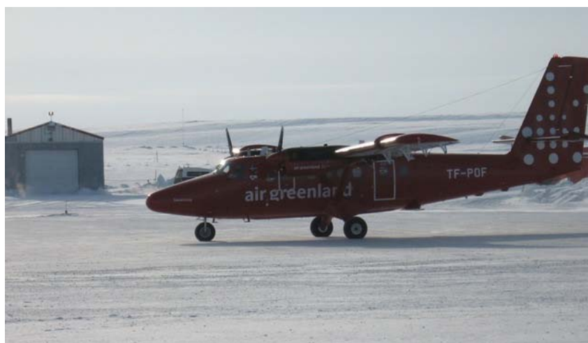
Twin Otter carrying ASIRAS

We ended our DTU-Space part of the CryoVEx campaign on 9 May. The Norlandair Twin Otter has flown about 85 hours, covering about 20 000 km. This is about the same distance as half way around the world at the equator. The map below shows our flight tracks.