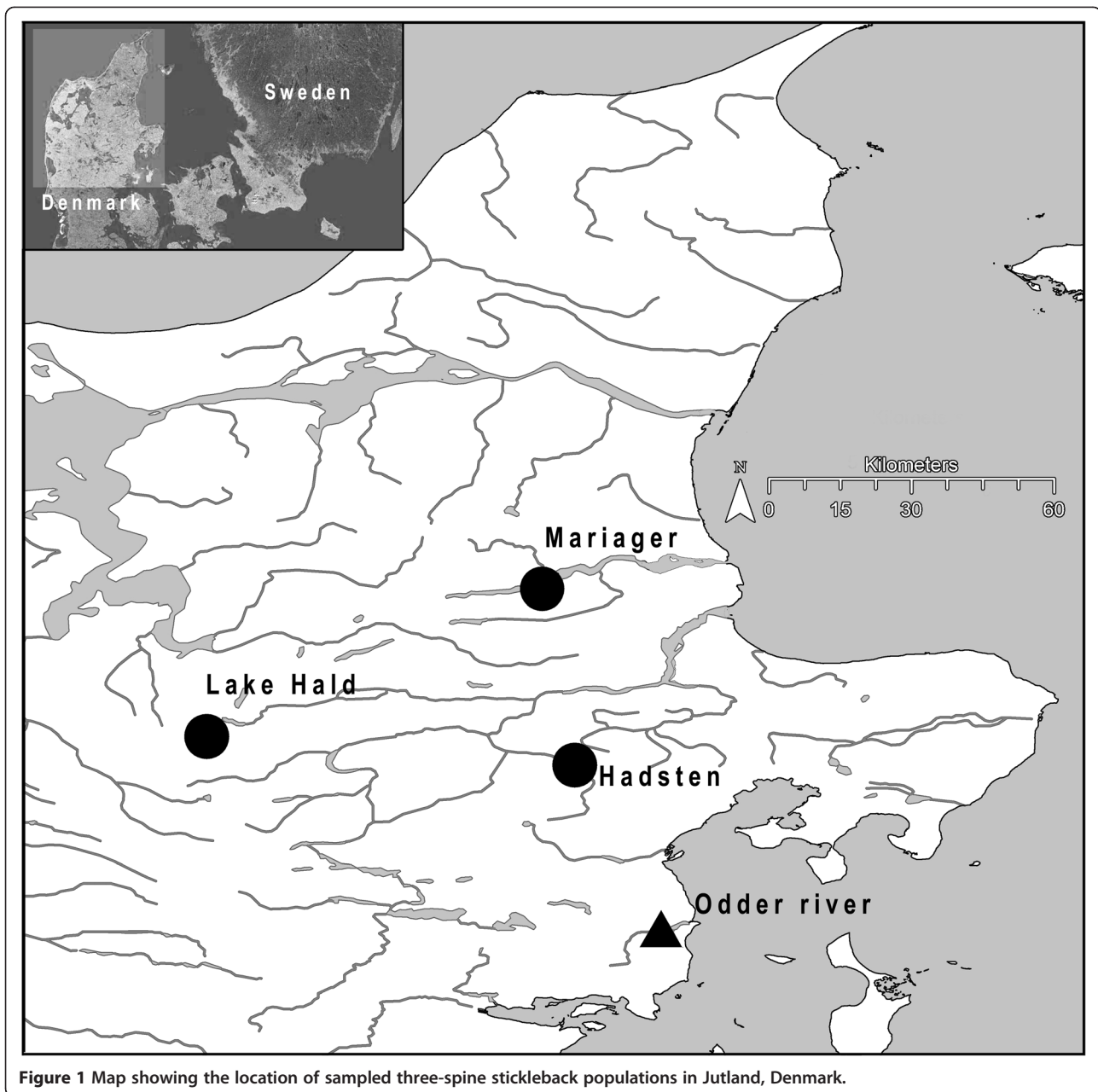
Figure 1 Map showing the location of sampled three-spine stickleback populations in Jutland, Denmark.

three alleles within individuals were also removed in order to avoid paralogs.