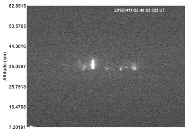
Figure 1. First optical image of sprites observed on 11 April 2012 at 22:48:53.823 UT.

On the night of 11 April 2012 at 22:48:53.823 UT, the first 'Sprite' events were recorded in Indian region above the thunderstorm (~35 km above the ground in the stratosphere) (Figure 1) located around (87°E, 24.5°N) ~220 km south east of Allahabad (25.4°N, 81.9°E) (Figure 2). The lightning activity (red dots) \pm 5 min at 22:48:53.823 UT which produced the sprites is shown in Figure 2. This observation is important as it opens new questions about the generation of sprite and related phenomena as well as characteristics of Indian thunder clouds; previously it was thought that because of low energy associated with lightning discharges and absence of MCSs in Indian thunder clouds TLEs cannot be generated and observed. The lightning dataset used in the present observation to understand the characteristic