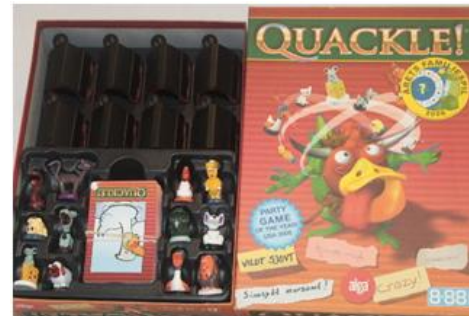
Figure 1. Photo of the game Quackle! with animals, cards, and barns on the left.

The game, which was awarded "Game of the Year" in Denmark in 2006, is a typical funny board game for humans aged 5 and above. In short, the game consists of 12 different animal figures, 8 barns, and 97 playing cards with pictures of the animals and one arrow card (see Figure 1). The game starts with each player pulling an animal figure from a cloth bag showing it to the others and then hiding it in his barn so the others can no longer see it. The cards are dealt and placed in a pile in front of each player face down.