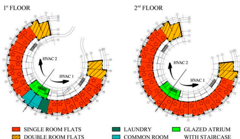
Figure 2. Layout of building, which was to be split into two similar-sized sections for experimental purposes.

The building and its ventilation scheme are shown in Figure 2.