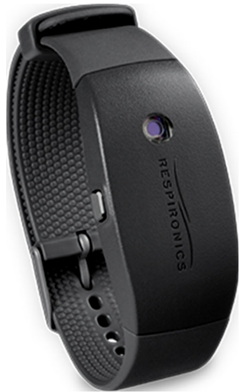
Fig. 1 Philips Actiwatch 2

Two measuring stations were used, one in the center of each side wall, to record the air temperature, relative humidity, and \text{CO}_2 concentration at 5-min intervals. No noise measurements were made inside or outside the room. A miniature data logger (HOBO U12-012) recorded the air temperature and relative humidity with an accuracy of \pm 0.35 K and \pm 2.5\% , respectively, and the signal from a \text{CO}_2 sensor (Vaisala GM20), calibrated for the range 0–5000 ppm, with an accuracy of \pm(2\% of range + 2\% of reading). The ventilation rates were calculated from the \text{CO}_2 concentration at steady-state and the \text{CO}_2 generation from each person, the latter based on an activity level of 0.7 MET (sleeping), a standard respiratory quotient of 0.83, and the DuBois body surface area of the subjects. The maximum \text{CO}_2 concentration during the night was used if no steady-state concentration was reached. Steady state was