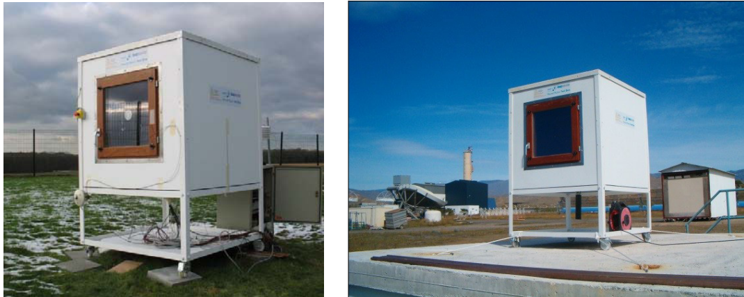
Figure 1. Test box during winter at the measuring site at BBRI, Belgium (left) and during summer at the Plataforma Solar de Almeria, Spain (right).

other hand is dry and extremely hot in summer, with large temperature amplitudes between day and night. During day time, solar radiation is very high on horizontal surfaces and the sky is usually very clear. Figure 1 shows the test box at both sites.