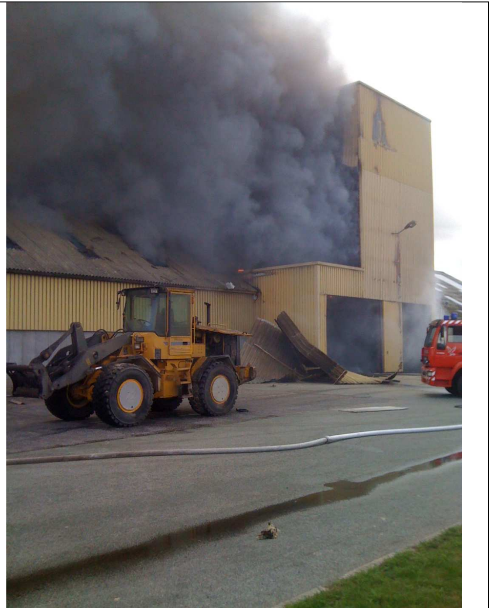
Figure 3 Photo taken one hour after the explosion. The wheel loader is similar to the accident wheel loader, note blown out wall panels. Picture taken from north.