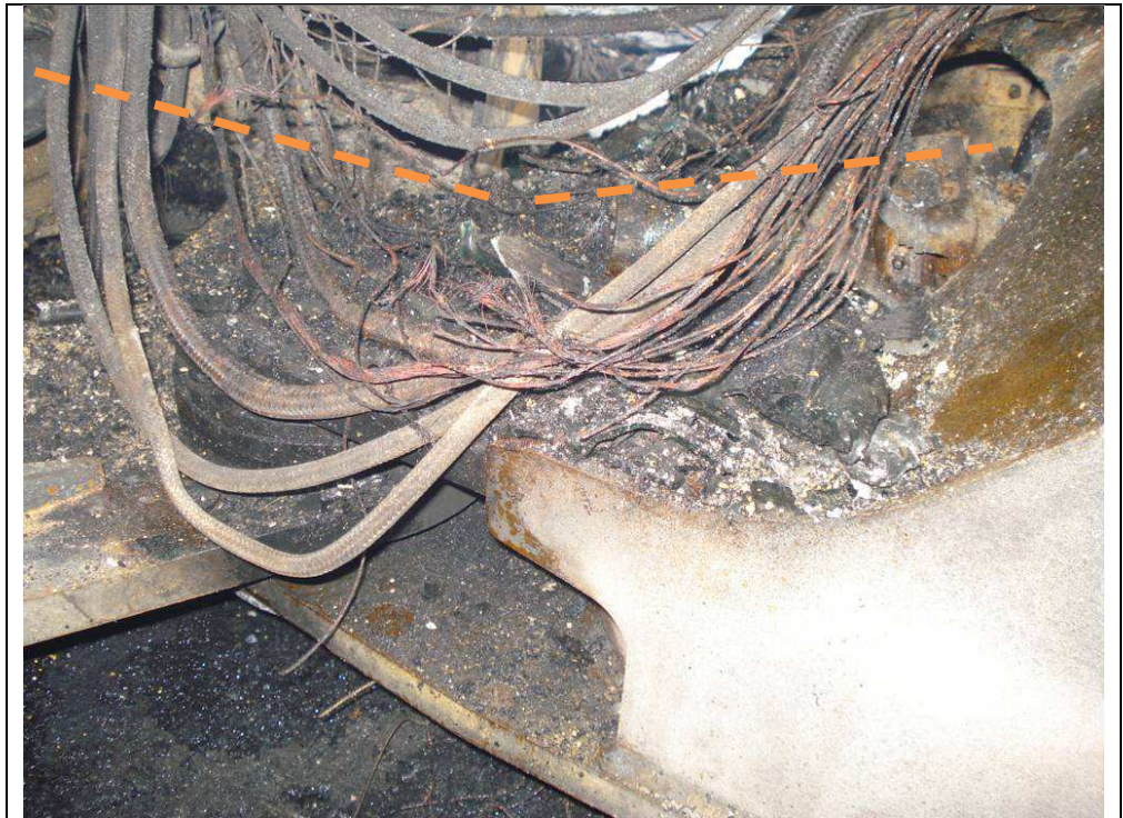
Figure 6 Torn electrical cables and fire damaged hydraulic hoses. Dotted line shows approximate position of missing universal (cardan) joint shaft. Hydraulic hoses appear intact.