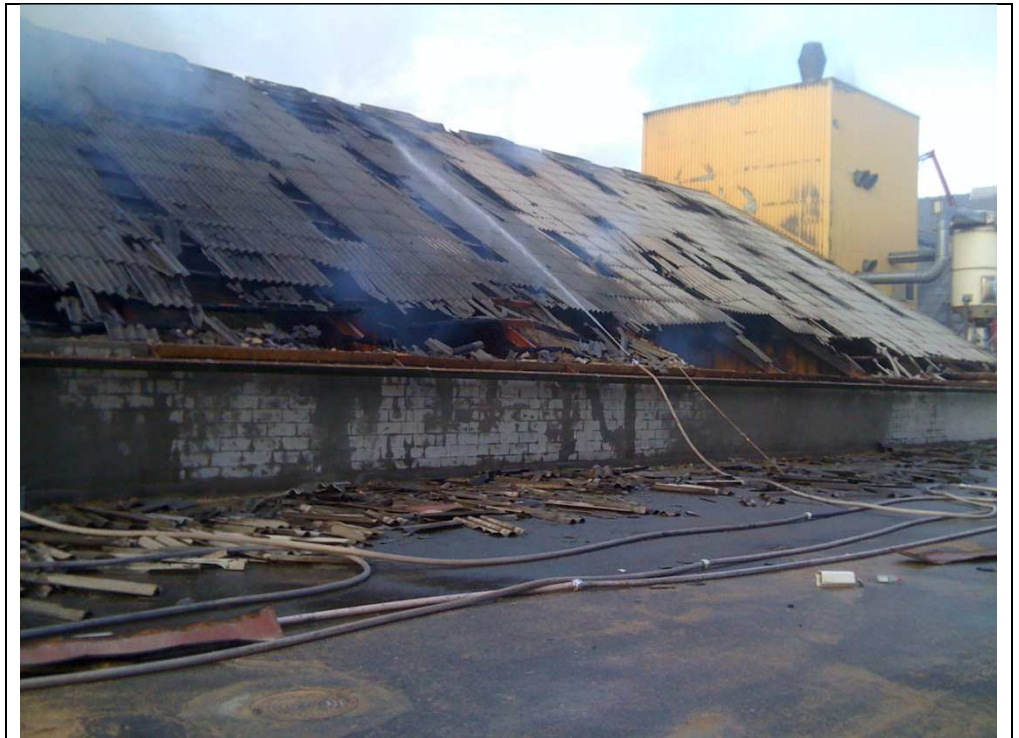
Figure 4 The many light fibre cement roofing panels that remained in place indicate that the explosion overpressure was modest. Note that the wall made of lightweight porous concrete blocks shows no blast damage. Wood dust compartment wall dividers are visible inside building. Photo taken from south.