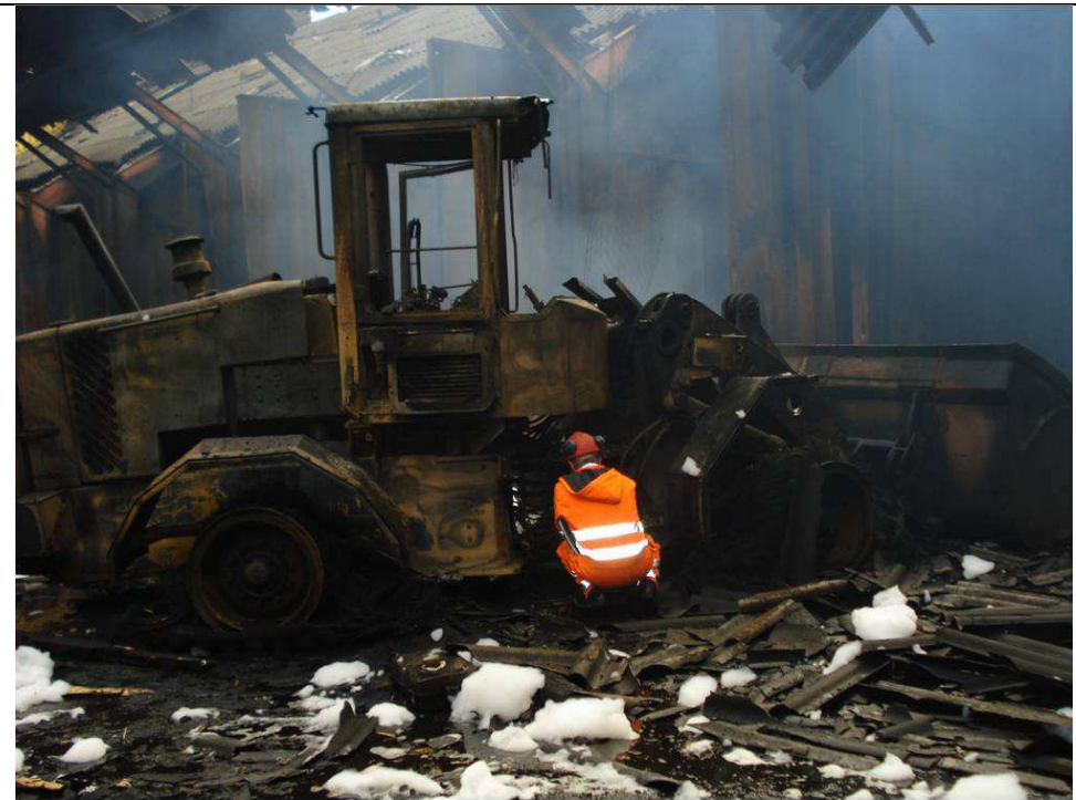
Figure 5 Examination of the wheel loader revealed that the universal (cardan) joint and shaft was missing. Windows in the driver's cabin melted in the intense heat. Tires are burned away.