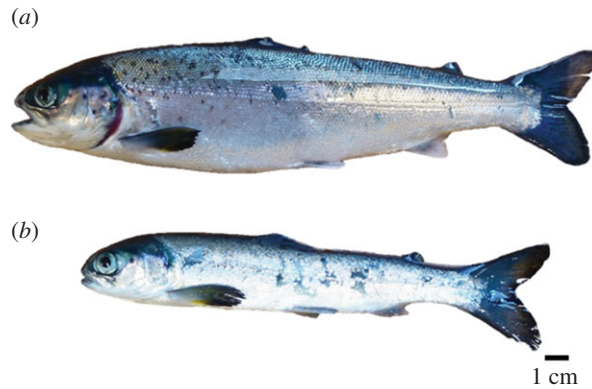
Figure 1. Representative pictures of healthy (a) and GS (b) fish from an aquaculture farm in the Langenuen Strait, Western Norway.