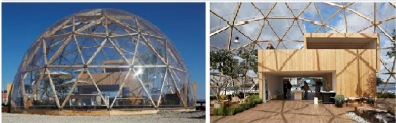
Fig. 2: Photo of Dome of Visions from outside (left) [14] and inside (right) [15]