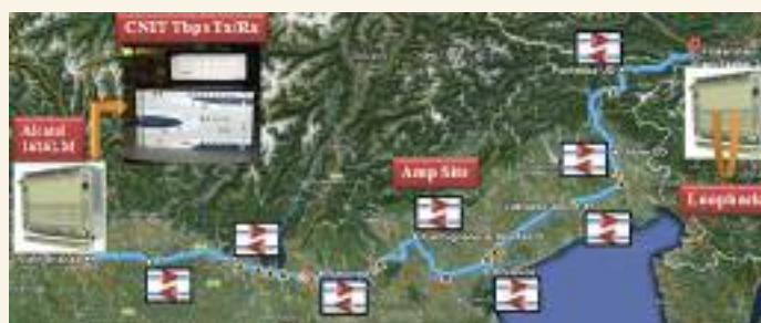
Figure 1: Milan-Finkenstein 675Km link for Tbps field trial

use of GÉANT infrastructures also pushes the relevance of the COFFEE objectives toward market visibility. GÉANT installed link between Milan and Finkenstein shown in Fig. 1 is being used to evaluate the 1Tbps transceiver prototypes in a real network infrastructure.