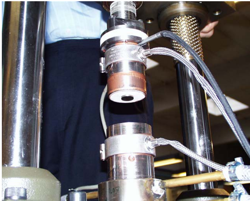
Figure 2 Testing equipment, open and without test specimen.