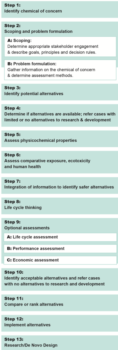
Figure 2: U.S. National Research Council (NRC) Alternatives Assessment Framework (NRC 2014)