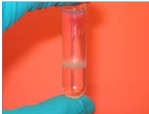
Viral band on Cesium-Chloride gradient