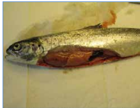
A. Salmon with petechiae in liver