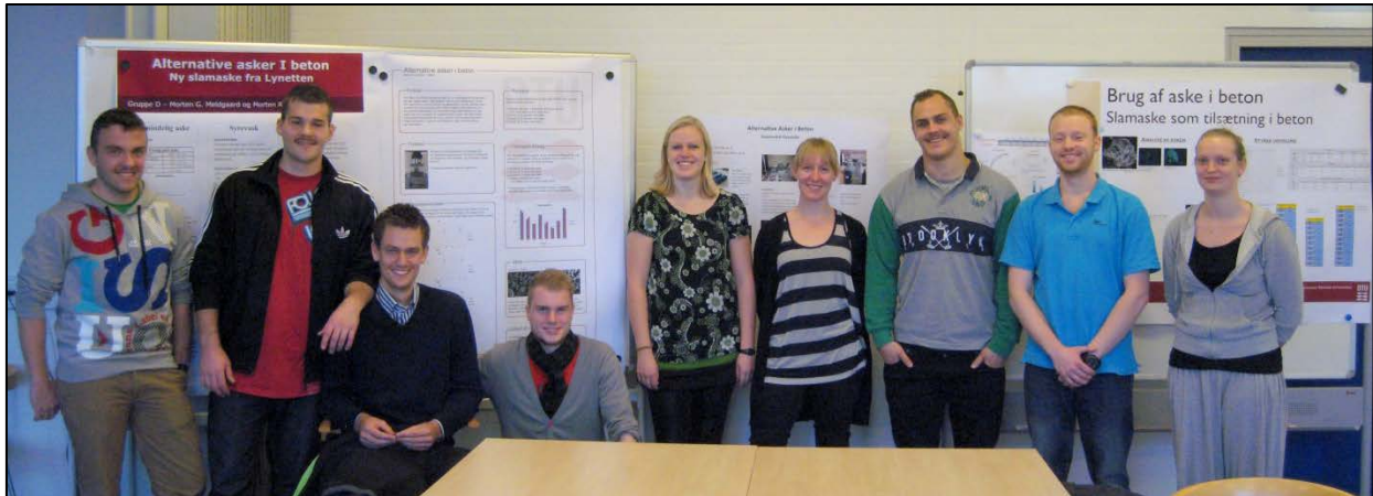
Figure 2 – Students in a project family at their midterm presentation.

The students appreciate the project family concept, as the period where the students do their thesis work can be a very stressful and lonely period for students, especially if they work individually. This problem seems to be eliminated with the project family concept, as they will always have a number of peers to discuss with. The concept has also established some amount of peer pressure, which is good for the somewhat relaxed students, but which have also improved their behaviour in the laboratories significantly. The supervisors have experimented with the size of the project family and have found that the optimal size will normally be 7 to 10 students, for the concept to work optimally.