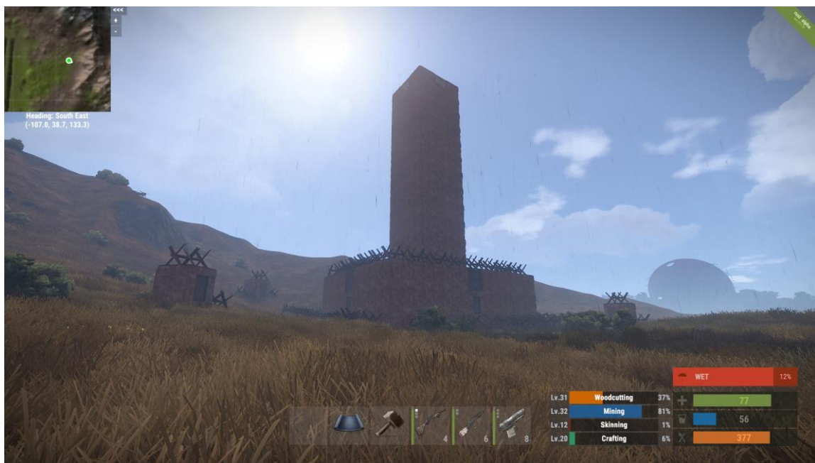
Figure 3. Screen shot from Rust showing the graphical interface and base building.

Warcraft (see Figure 3). Similar to other MMORPGs, Rust also has a crafting menu where players can create new items they can use in the game. Moreover, players view the game world through a first-person view that is generated by a game engine called Unity. Unity provides the graphical backbone for the game, which enables high-quality physics, lightning, and animations to provide an immersive experience for players. Simultaneously, the sound system provides atmosphere and situational awareness to the players, as they can hear animals and enemies close to their location. For example, when we played the game, the sound system tended to create an extra feeling of paranoia during raids, when we could hear other players moving around in their base. However, players are also restricted through the first-person view and physical borders of the game, which is set on a large island.