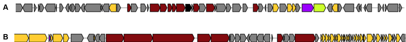
Figure 3. ARTS cluster visualizations from example genome Streptomyces roseochromogenes DS 12.976 where core genes are shown in yellow, known resistance in green and hits for both shown in purple. (A) Purple: positive control of resistant gyrB , Green: DNA topoisomerase IV (B) Example of cluster boundaries capturing core genes not associated with the cluster.