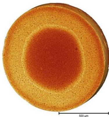
Figure 2. Computed X-ray micro tomography image of reconstructed 3D volume of the Ni-Fe catalyst on a \gamma-Al_2O_3 sphere.