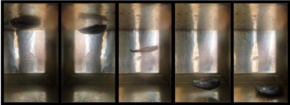
Figure 1: Illustration of the sinking of the residue after flame extinction for the burning of IF30, 40 mm initial thickness. Each picture illustrates approximately a time interval of 2 s.