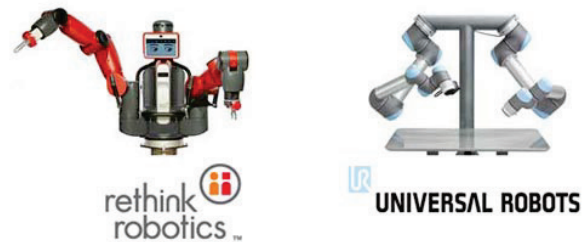
Fig. 3. Robots from Rethink Robotics and Universal Robots.

disruption of an industrial sector such as the industrial robot sector, where the growth now is characterized by the development and sales of such low-cost, user-friendly robots. The development of such robots was based upon the extensive knowledge gained in playful robotics, LEGO robots for kids, minimal robot systems, user-friendly, behavior-based, biomimetic, modular robotics and intelligent systems.