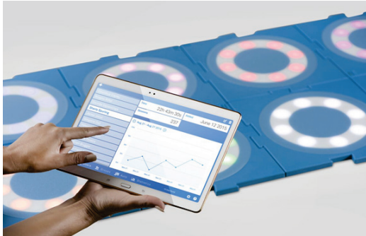
Fig. 4. The Moto tiles and the tablet interface.

Qualitative studies suggest that the high health effect from playing with the Moto tiles arises from the fact that the Moto tiles act as a play force, which pushes the participants into a play-dynamics, in which they forget about time and place, and thereby perform more than they would normally do. In play, they may forget about their fears of falling and forget about their perceived physical and cognitive limitations.