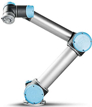
Fig. 2. One of the Universal Robots industrial robot arms.

with pure ferocity. It culminated in 1998 when we won the football World Cup for robots, which was seen by 50 million people. Football robots could be programmed by children without any technical knowledge, and if children can learn to program robots, then all people can learn it. This approach was one of the fundamental values of our company Universal Robots. We found out that Danish food companies needed to be able to adapt quickly. It was absolutely impossible to do that with the existing robots. So we built a robotic arm that could be reprogrammed easily and without specialist knowledge, and the idea turned out to be pretty good.” [8]