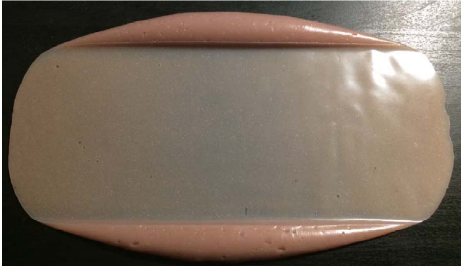
Figure 3: Final geometry of the specimen after SF experiment.