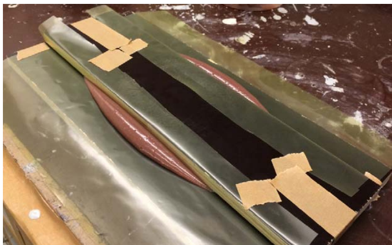
Figure 2: Deformed adhesive after SF experiments.