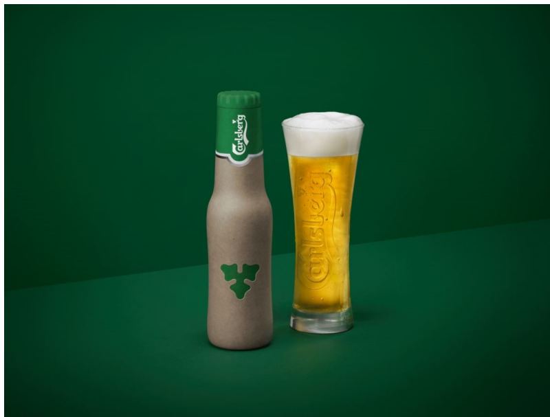
Figure 1: Illustrative image of the Green Fiber Bottle (GFB).

The GFB will replace plastic and glass bottles, thus reducing their impact on the environment, especially the oceans. For example, the life span of a plastic bottle in the ocean is 500 years, and during its degradation, the plastic is reduced to micro pieces, which can cause the starvation of several marine animals. The new bottle is made from molded paper pulp, which is a renewable resource. The bottle could thus be left to biodegrade in nature or enter a recycle system, along with other paper-based product.