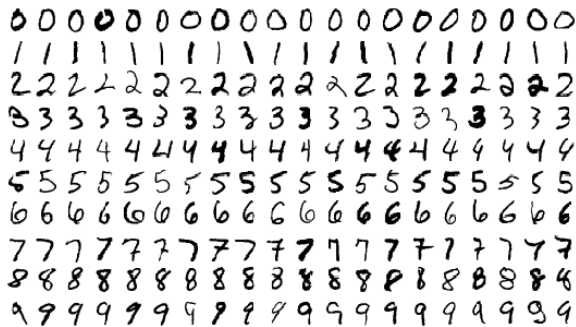
Fig. 2. Visualisation of small subset of MNIST - the training dataset

The dataset used for the training has been chosen to be the collection of handwritten digits, collected and published by Lecun in [11]. Sample of examined data has been shown in Figure 2. The set consists of 60,000 training images and 10,000 validation images. Each image has a size of 28 \times 28 and represents a digit from 0 to 9. Pixel values have been normalized to lay in [0, 1] range. The data did not undergo any augmentation.