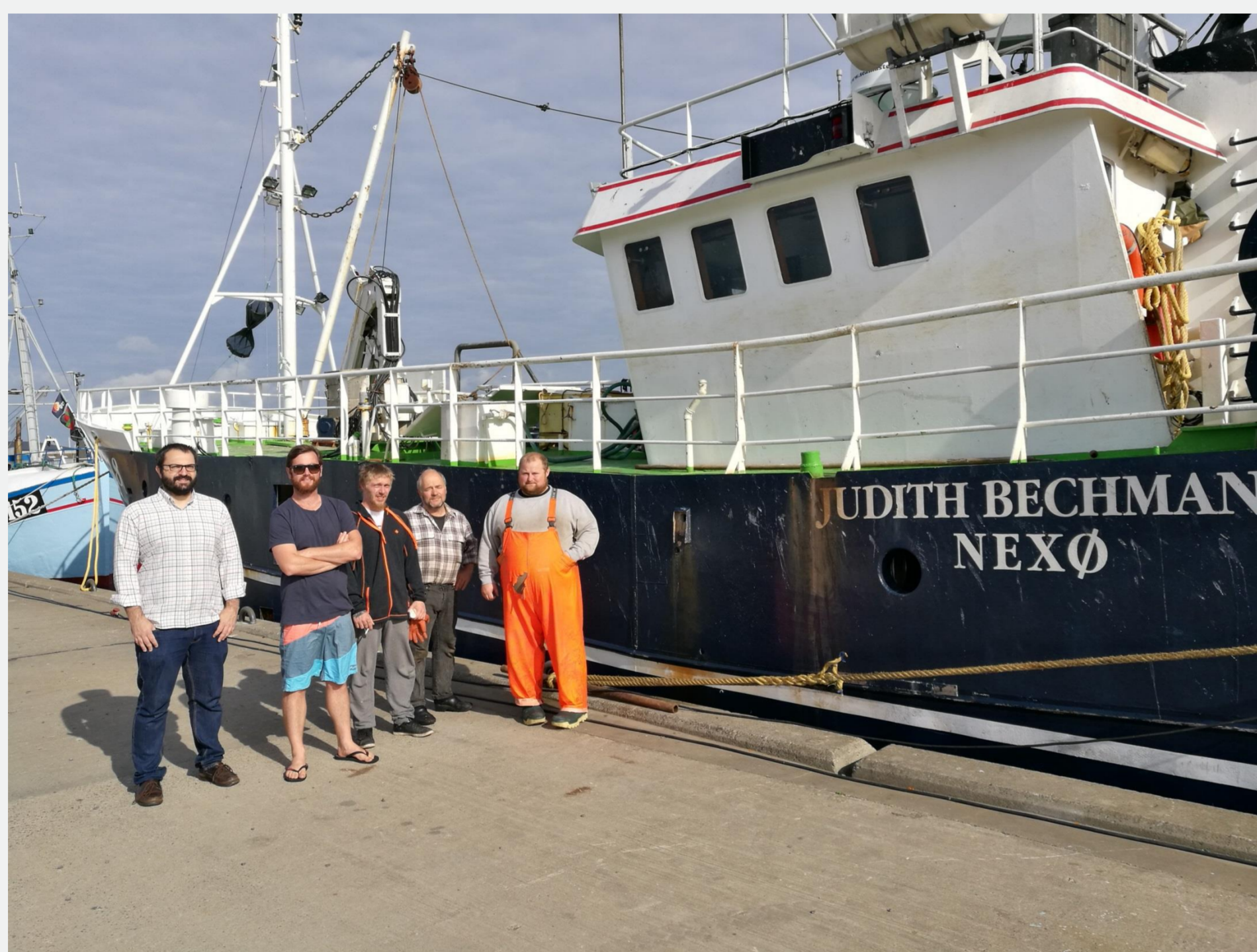
One of the vessels involved in the project, R 218 Judith Bechmann, together with its crew and scientists from DTU Aqua.

Under the Landing Obligation, the ability for fishermen to adjust the selectivity of their gears to suit the quotas which are available to them will be an important factor in determining the revenue in the fishery. As the combination of gear, fishing practice and quota shares will differ between vessels, changes to the selectivity of the gears will need to be implemented at the vessel level and based on the quotas which are available to the vessel at a given time. For this to be realised, simple and cost effective solutions which can be quickly coupled with existing gears will be in demand. These solutions will need to be implemented quickly in order for them to solve the issues at hand without losing substantial income. Furthermore, these solutions will need to be scientifically tested to document their effect before being considered for implementation into the legislation.