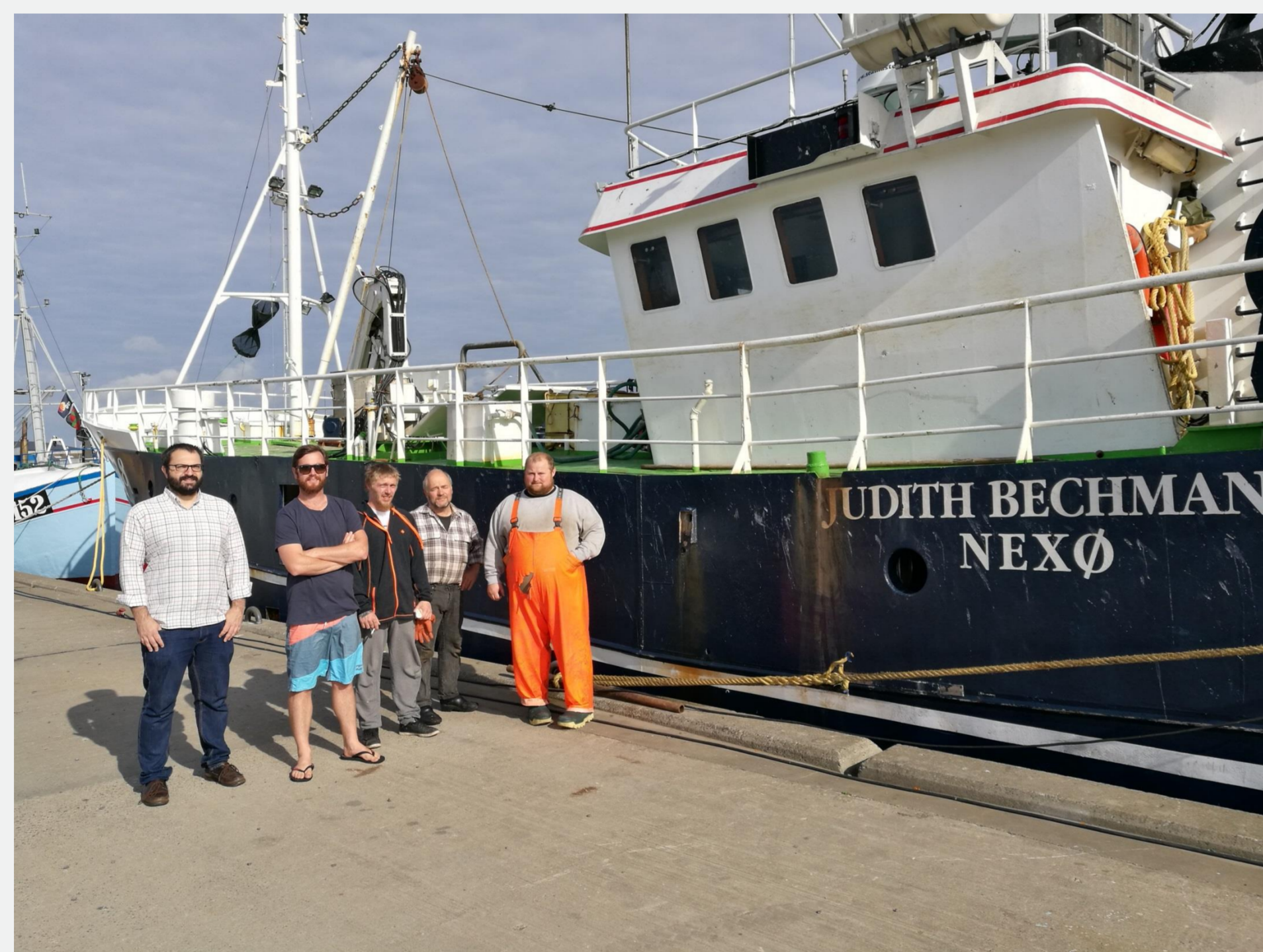
One of the vessels involved in the project, R 218 Judith Bechmann, together with its crew and scientists from DTU Aqua.

Under the Landing Obligation, the ability for fishermen to adjust the selectivity of their gears to suit the quotas which are available to them will be an important factor in determining the revenue in the fishery. As the combination of gear, fishing practice and quota shares will differ between vessels, changes to the selectivity of the gears will need to be implemented at the vessel level and based on the quotas which are available to the vessel at a given time. For this to be realised, simple and cost effective solutions which can be quickly coupled with existing gears will be in demand. These solutions will need to be implemented quickly in order for them to solve the issues at hand without losing substantial income. Furthermore, these solutions will need to be scientifically tested to document their effect before being considered for implementation into the legislation.