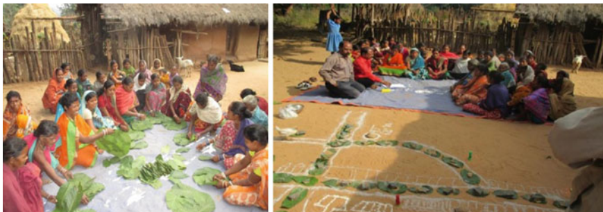
Fig. 10.4 Tribal women in manual stitching of sal leaf plates activity