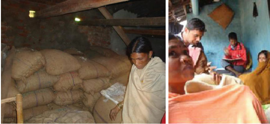
Fig. 10.3 Cashew stored for selling and the local family involved

of cashew stored in gunny bags along with tribal family involved in this activity is given in Fig. 10.3.