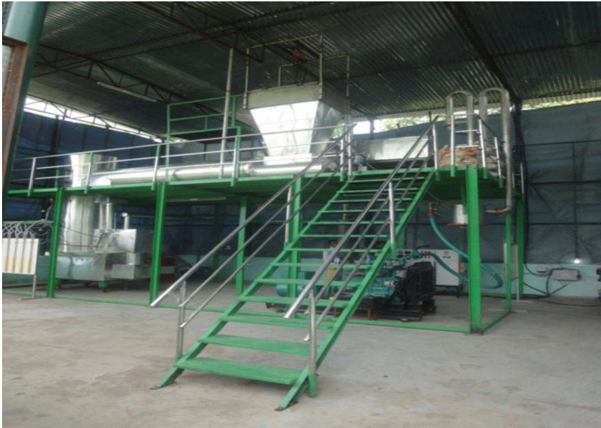
Fig. 10.7 Two-stage biomass gasifier in Rayagada, Odisha