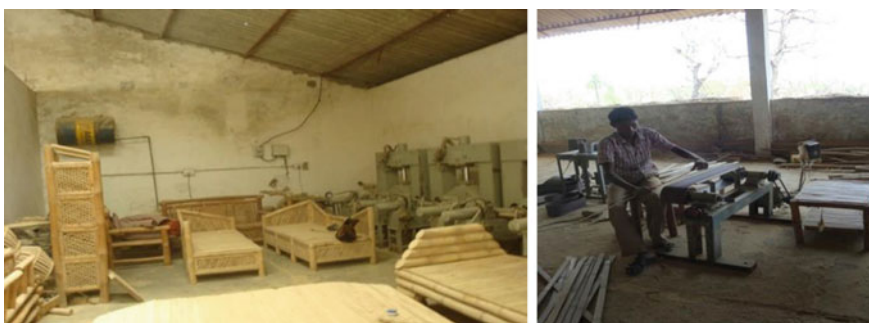
Fig. 10.5 Making of bamboo furniture

Under the project, full ownership of the power plant of two-stage biomass gasifier rests with the SHG federation. This body will have the sole responsibility of managing the affairs of the gasifier system for running of the bamboo furniture making factory, which is their sole livelihood activity. With the revenue generated by the sale of electricity and the income from by the sale of their products, they will be in a strong position to pay for the salary of the operator, the biomass supply and maintenance. This will allow them to be completely self-sufficient in their activity.