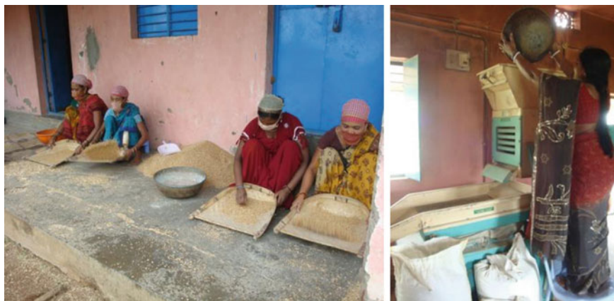
Fig. 10.6 'Nutrimix' making by members of MDMMS

There is irregular electricity supply in this area, and the quantity and quality of the product suffer due to it. The two-stage biomass gasifier will provide regular and clean supply of electricity at a low cost, which will increase the production and their income by over 500%. The increase in production will support more women and children at the Anganwadi centres, and the increase in the income generated will improve standard of living of the workers and give them an opportunity to explore more activities and build training centres.