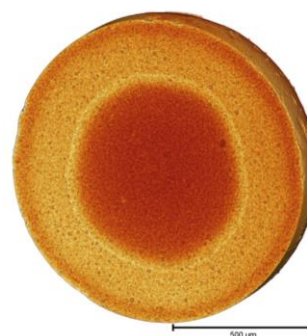
Figure 2. Computed X-ray micro tomography image of reconstructed 3D volume of the Ni-Fe catalyst. The \gamma -Al 2 O 3 sphere is approx. 1 mm in diameter.