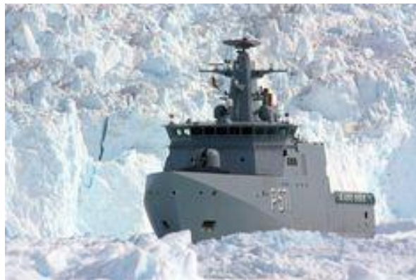
Figure 1: Royal Danish Navy patrol vessel in ice filled waters near Greenland

To permit high-performance manufacture of naval vessels, it is inevitable that the structural design of the vessel will necessitate large unstiffened panels that are susceptible to large deformation under repeated cyclic loading, caused by a combination of in-service loading from a variety of sea states as well as accidental loads. Failure often occurs as a consequence of either manufacturing flaws or in-service loads experienced by the structure, such as general overload and impact events, eg. hull bottom slamming, which exacerbate the effect of the ongoing fatigue loading.