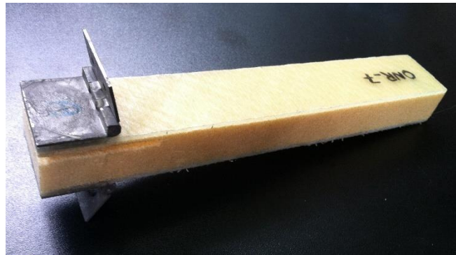
Figure 1: Navy type sandwich composite MMB specimen

The MMB sandwich specimens used in this experiment have been cut out of the test panel which has been manufactured using a resin infusion process. The artificial debond starter crack has been created by placing a thin Teflon film insert at the upper face/core interface before resin injection. However, it has been observed for sandwich composite specimens with H100 core that a crack can propagate either in the core, in the face sheet or in between the face and core depending on the mode-mixity at the crack tip and the fracture toughnesses of three crack positions respectively [1]. The specimens have been cut in a rectangular shape with