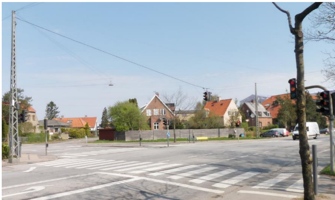
Figure 1-4: Above is a photo of the intersection between Lykkebovej / Vigerslev Allé; Below (left) is a map of the intersection with indications of the air sensor placements (right top and bottom) as well as the micro radar (right bottom).

Since the aim is to have higher percentages, as it shows that the model is more predictable, there is a high degree in accuracy in cases when multiple sensors are used. Thus, it was more accurate to investigate the correlation between air pollution levels and traffic signals regimes for the intersection of Lykkebovej / Vigerslev Allé using the Leapcraft's algorithm.