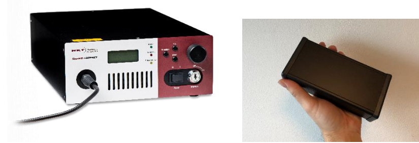
Fig. 1: Left Commercial silica kHz SC source. Right super compact lightweight fluoride fiber based SC source optimized for portable sensing applications.

as part of the EU project FLAIR[12]. Aside from this drone application this system could also be considered for other mobile applications as even with continuous operation it could run 3-4 hours on a standard laptop battery and much longer if only sampling measurements were required at intervals.