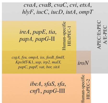
FIG 2 Diagram of ExPEC-associated gene distribution in the three groups; the two human ExPEC clusters HExPEC-1 and HExPEC-2 and the mixed avian/human ExPEC A/E-PEC cluster. Genes associated with the A/E-PEC are located in the gray box. HExPEC-1-associated genes are located in the yellow box. HExPEC-2-associated genes are located in the orange box.

The HExPEC-1 cluster was distinctly separated from the remaining genomes in both the SNP phylogeny and accessory-genome-derived tree, while the HExPEC-2 cluster demonstrated a clear separation only in the accessory-genome-derived tree. The HExPEC-1 was distinguishable from other strains by two canonical SNPs as well as several accessory genome features, while the HExPEC-2 cluster constituted a distinct subclade in the accessory genome, defined by the presence of two cut genes. The two canonical SNPs that differentiated the HExPEC-1 were both in the nicotinamide ribose kinase domain of the nadR gene and were both nonsynonymous. NadR is a trifunctional protein involved in regulation of NAD and associated fermentation pathways and