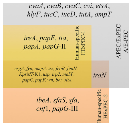
FIG 2 Diagram of ExPEC-associated gene distribution in the three groups; the two human ExPEC clusters HExPEC-1 and HExPEC-2 and the mixed avian/human ExPEC A/E-PEC cluster. Genes associated with the A/E-PEC are located in the gray box. HExPEC-1-associated genes are located in the yellow box. HExPEC-2-associated genes are located in the orange box.

The HExPEC-1 cluster was distinctly separated from the remaining genomes in both the SNP phylogeny and accessory-genome-derived tree, while the HExPEC-2 cluster demonstrated a clear separation only in the accessory-genome-derived tree. The HExPEC-1 was distinguishable from other strains by two canonical SNPs as well as several accessory genome features, while the HExPEC-2 cluster constituted a distinct subclade in the accessory genome, defined by the presence of two cut genes. The two canonical SNPs that differentiated the HExPEC-1 were both in the nicotinamide ribose kinase domain of the nadR gene and were both nonsynonymous. NadR is a trifunctional protein involved in regulation of NAD and associated fermentation pathways and